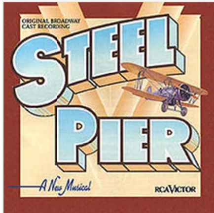
Steel Pier (1997) was the last Kander and Ebb show to be produced on Broadway before Fred Ebb's death in 2004.