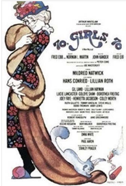
70, Girls, 70 (1971), one of the few Kander and Ebb shows to take place in the present tense, closed on Broadway after only 35 performances.

JK: I have a theory about that and it has to do with operas as well as musicals. If you look at it realistically, ordinary people during their ordinary day do not suddenly burst into song. If you look at the operas that have lived and the musicals that have lived, they all are at some remove from the audience. There are very few exceptions. If you look at all the Jerome Kern musicals with those wonderful songs in them, all of which were contemporary comedies, the only one which lives as a piece is Show Boat because it was at a remove. It has an atmosphere that is exotic to the audience.