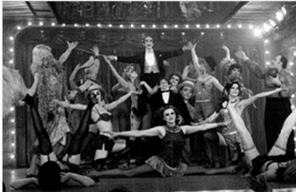
From Kander and Ebb's most successful musical, Cabaret (1966): Joel Grey and company at the Kit Kat Club.

I can remember when we were writing Cabaret and were talking about the subject, people said "That's really not a good idea."