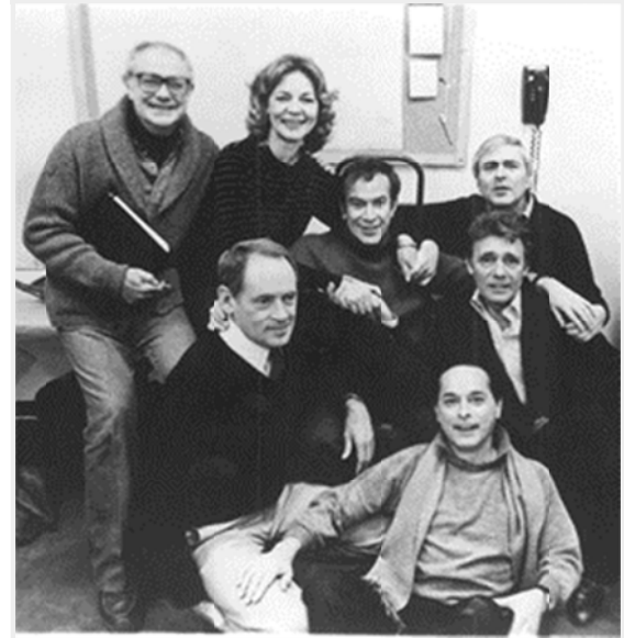
Woman of the Year (1981): (left to right) Peter Stone, Lauren Bacall, Ebb, Harry Guardino, Kander and other members of the original cast.

FJO: That raises another interesting issue. At the very beginning of our conversation you were saying that once upon a time about fifty percent of popular music was music that came out of Broadway musicals and that is no longer the case, and it hasn't been for decades at this point. But you circumvent that issue in your shows by taking them outside of the here and now. Even Steel Pier takes place in another era. And shows like The Happy Time and The Rink are all about reliving memories. A Family Affair took place in the present, but when you wrote it the sound of Broadway show music was still part of mainstream popular music. But the only later show of yours I can think of that takes place completely in the present is 70, Girls, 70 . However since that show is about elderly people who live in a retirement home, it's perfectly natural that the kind of music they sing would sound like music from an earlier era.