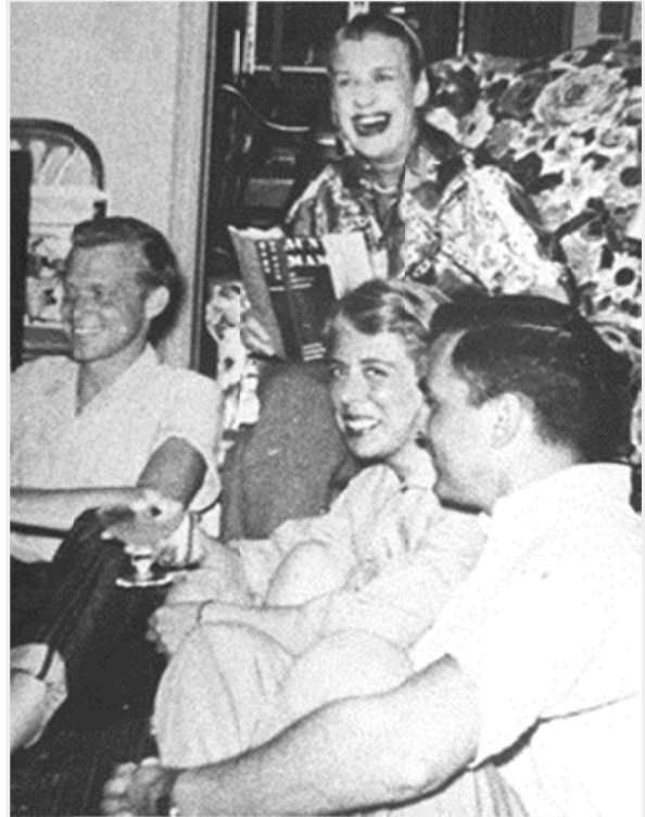
A young John Kander (far right) relaxing with stage legend Beatrice Lillie (reading).

And then she went on to become the stage manager for Gypsy and she needed somebody to play the auditions. So she asked me to do that and I said yes. So for weeks and weeks and weeks I was there playing piano for people who came in to audition for Jerome Robbins. And so he got used to me, and at the end of that period, he said literally, "Hey, do you want to do this show with me?" And I said, "Do you want me to?" And he said yes, and I said yes. So I became the dance music arranger for Gypsy , and from that I did the dance music for another show, Irma La Douce .